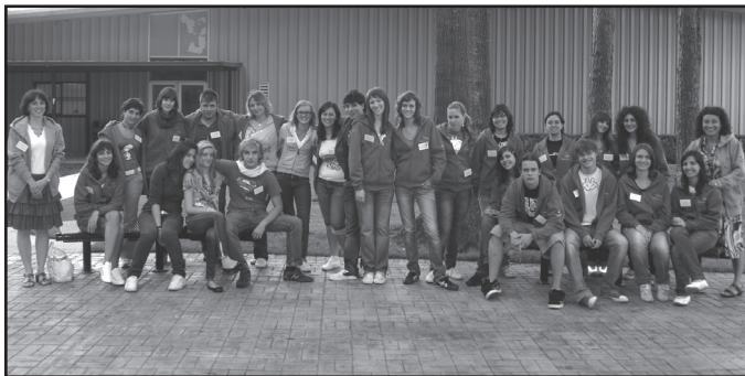
Prep hosted these Italian students and teachers through the Italian Studies and Exchange Program

The benefits of these changes to the Italian Studies and Exchange Program can only promote the program's original intentions and the overall goals of making Prep students aware of their places as citizens of the world, and of reminding them of their responsibilities to the global community.